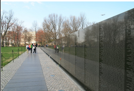
From a friend

The most casualty deaths for a single month was May 1968 - 2,415 casualties were incurred.